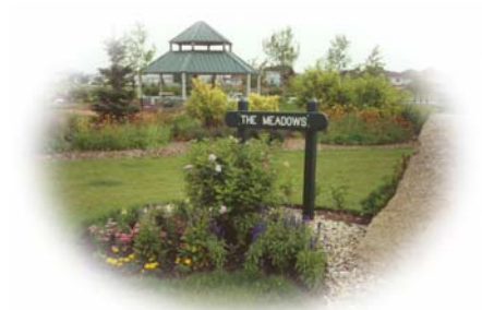
Parks & Open Space Division