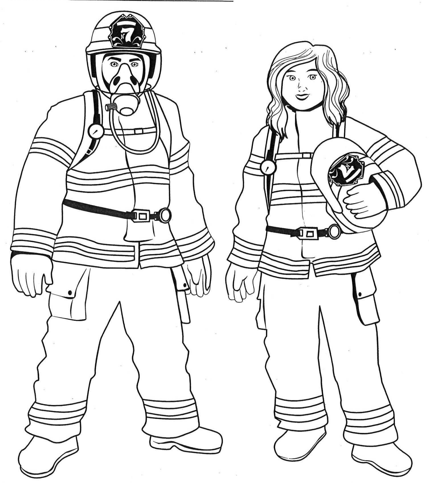
Firefighters are community helpers and help if there is an emergency. They wear special gear to help them stay safe from fire and smoke. The equipment can look and sound scary, but it keeps them safe.