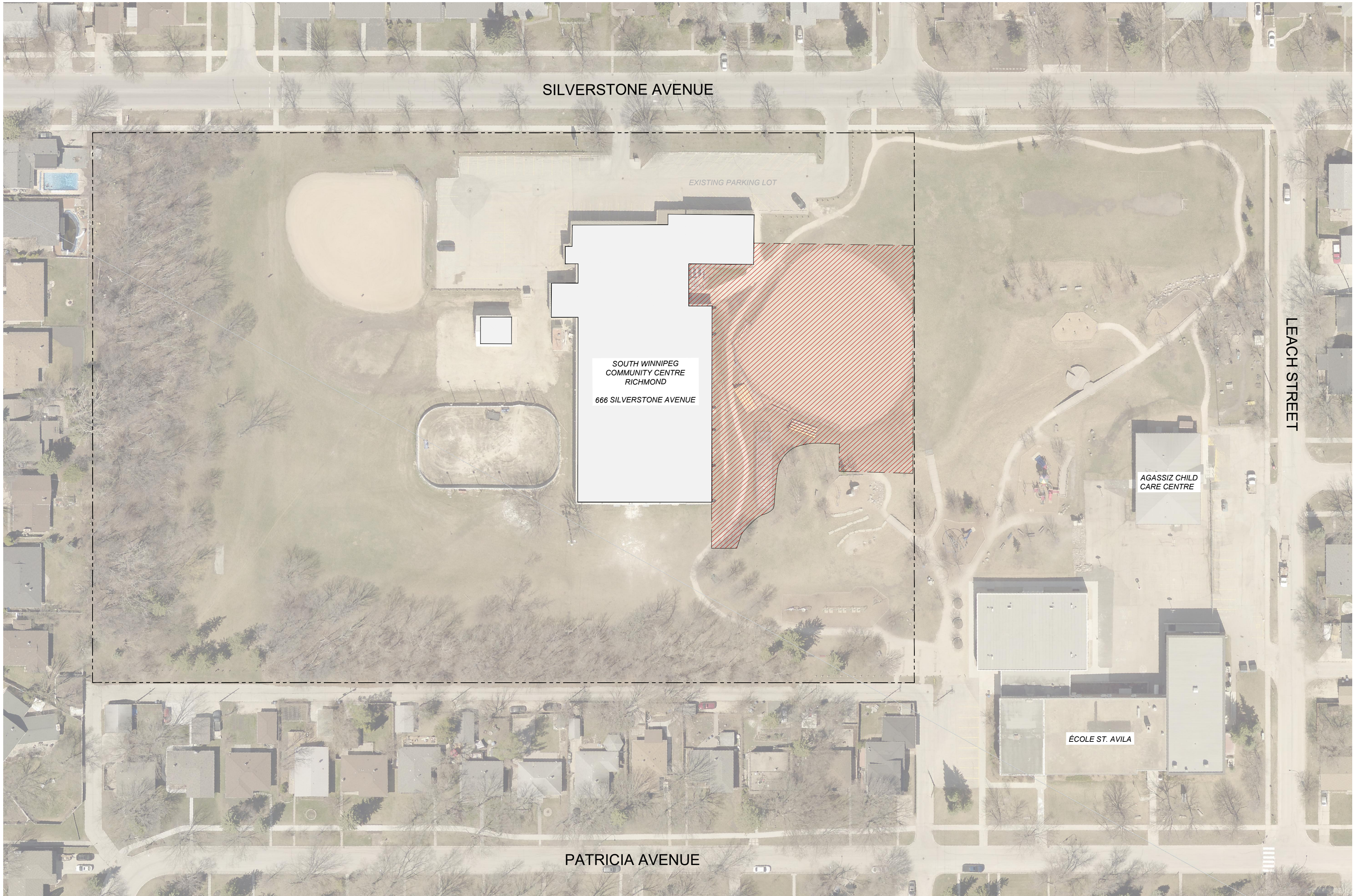
1 L000 KEY PLAN 1:750