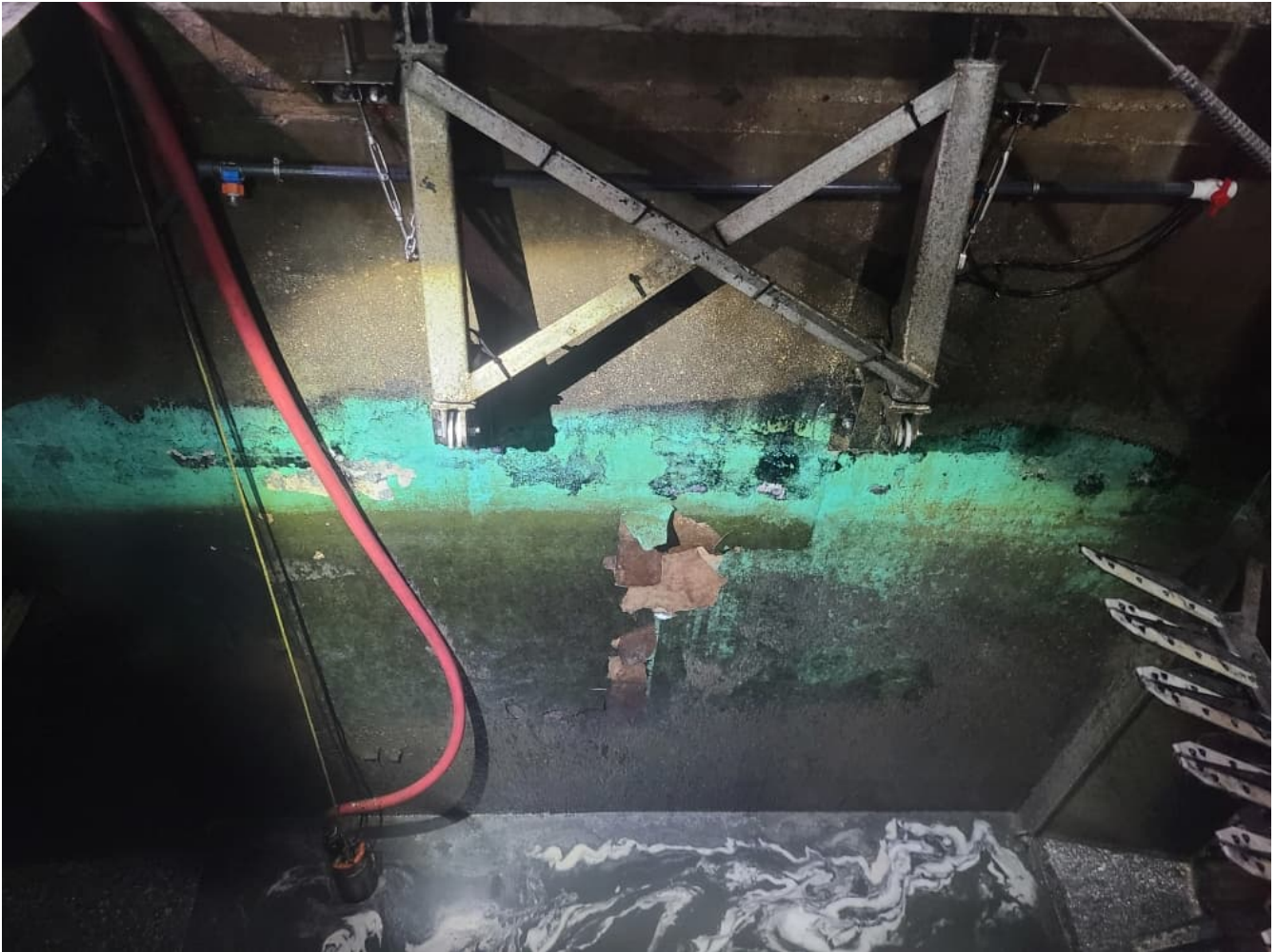
Photo 8: Mid-point of Channel, between Lamp Banks. Opposite Side of Photo 7.