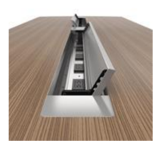
Example of a flush, power/USB module.