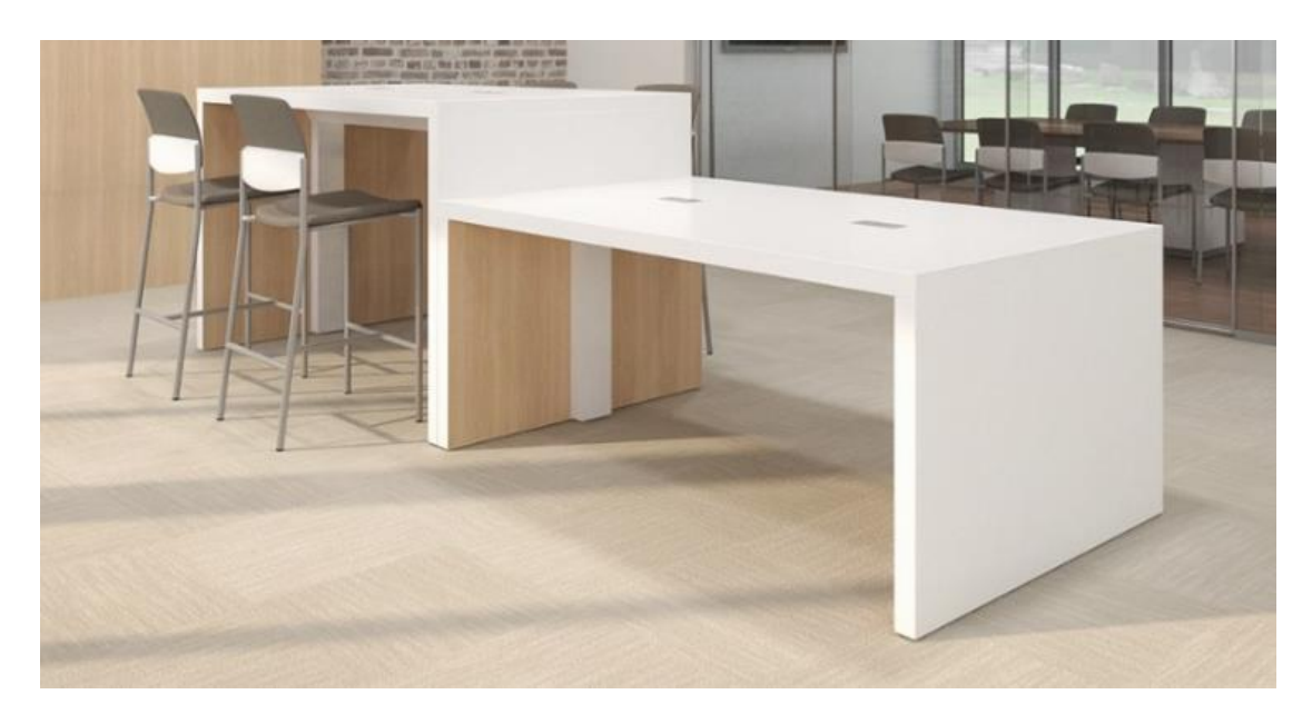
Example of a power/data module recessed in trough with flush, flip up access door.

( Note: Images shown below are for general design intent only and may not show all features noted above in specifications.)