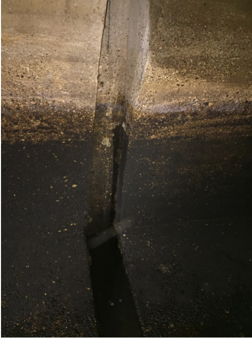
Photograph 17. ↑ Mile 73.69 – Existing Groove (Side of Aqueduct)