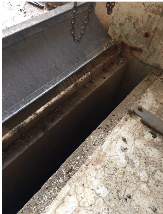
Photograph 16. ↑

Mile 73.69 – Existing Stop Log Opening and Cover