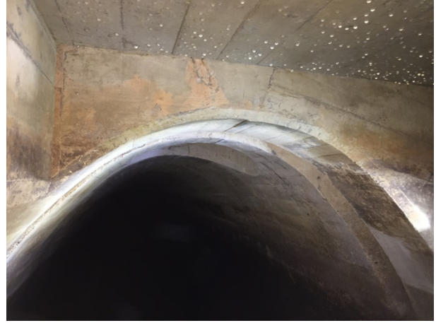
Photograph 10. ↑

Mile 64.14 – General Site (Concrete Cover not Shown – To be Removed by City prior to Construction)