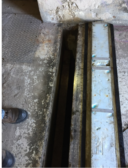
Photograph 2. ↑ Mile 17.05 – Existing Stop Log Opening and Cover