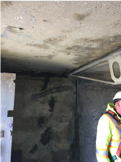
Photograph 3. ↑ Mile 17.05 – Boathouse Interior Wall and Roof