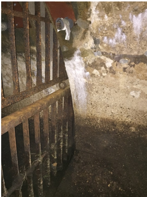
Photograph 7. ↑

Mile 17.05 – Existing Groove (Grating to be Removed)