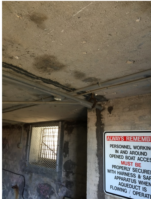
Photograph 4. ↑ Mile 17.05 – Boathouse Interior Wall and Roof