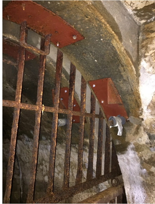
Photograph 6. ↑

Mile 17.05 – Existing Groove (Grating to be Removed)