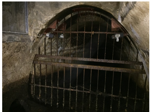
Photograph 8. ↑

Mile 17.05 – Existing Groove (Grating to be Removed)