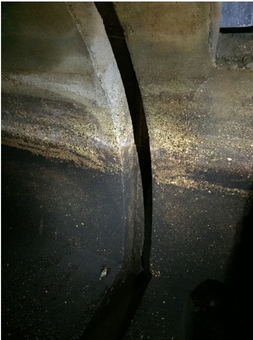
Photograph 19. ↑ Mile 73.69 – Existing Groove (Side of Aqueduct)