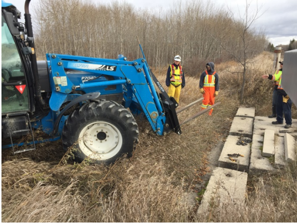
Photograph 9. ↑

Mile 64.14 – General Site (Concrete Cover not Shown – To be Removed by City prior to Construction)