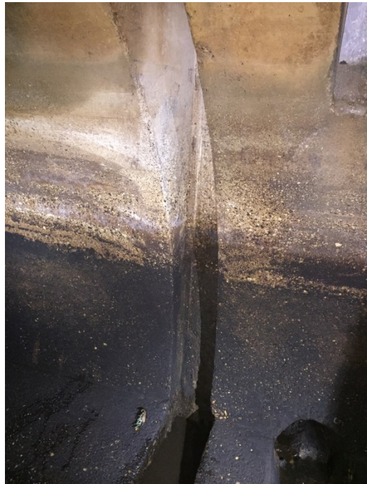
Photograph 20. ↑ Mile 73.69 – Existing Groove (Side of Aqueduct)