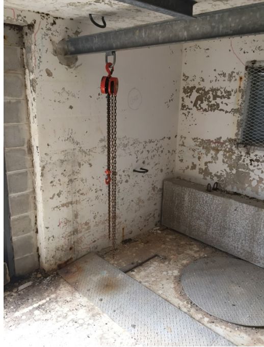
Photograph 14. ↑

Mile 73.69 – Boathouse Interior and Stop Log Access Cover