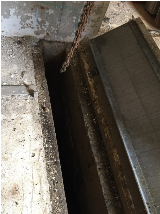
Photograph 15. ↑

Mile 73.69 – Boathouse Interior and Stop Log Access Cover