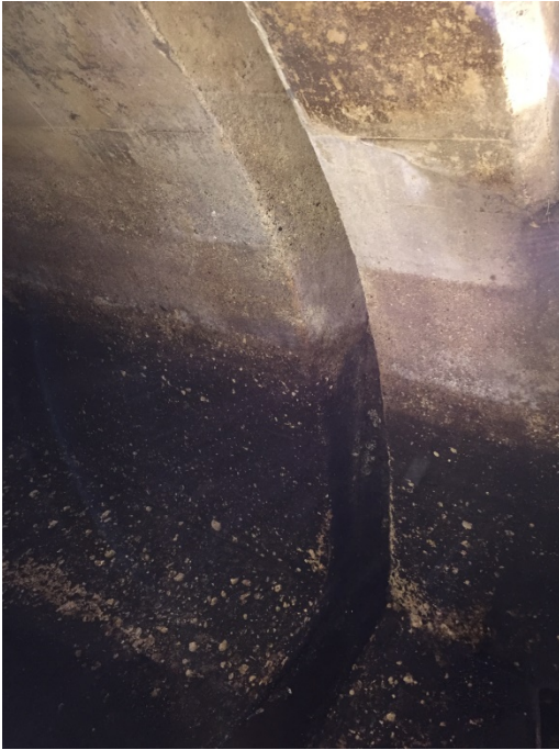
Photograph 11. ↑

Mile 64.14 – Existing Groove (Top of Aqueduct)