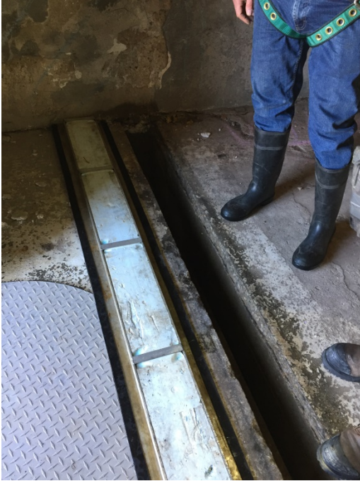
Photograph 1. ↑ Mile 17.05 – Existing Stop Log Opening and Cover