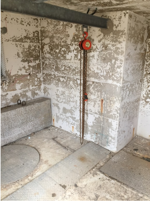
Photograph 13. ↑

Mile 73.69 – Boathouse Interior and Stop Log Access Cover