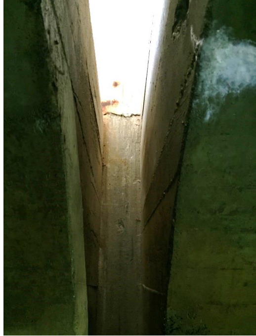
Photograph 18. ↑ Mile 73.69 – Existing Groove (Top Corner, Below Floor Opening)