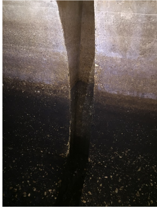
Photograph 12. ↑

Mile 64.14 – Existing Groove (Side of Aqueduct)