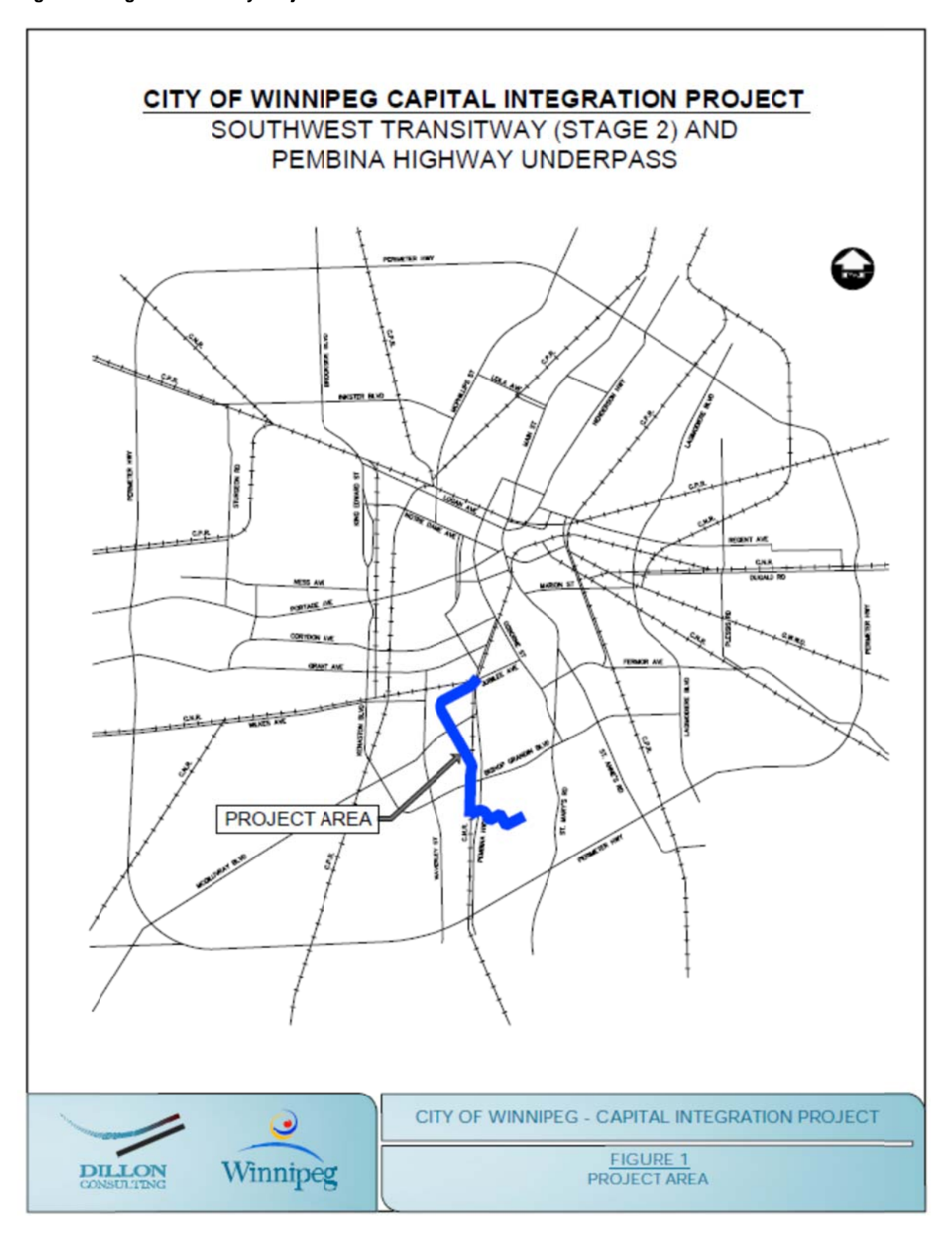
Figure 1: Stage 2 Transitway Project Location